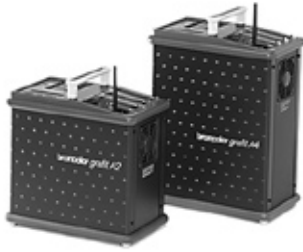
Grafit A2 / RFS 31.166.XX / 31.169.XX Grafit A4 / RFS 31.176.XX / 31.179.XX