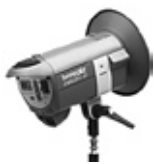
Minicom 40 / RFS 31.405.XX / 31.406.XX