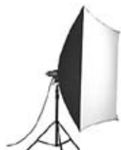
Pulsoflex C 150 x 150 33.445.00

Adapter ring and stands are not included