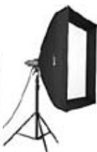
Pulsoflex EM 110 x 110 33.408.00