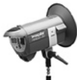
Minicom 80 / RFS 31.415.XX / 31.416.XX