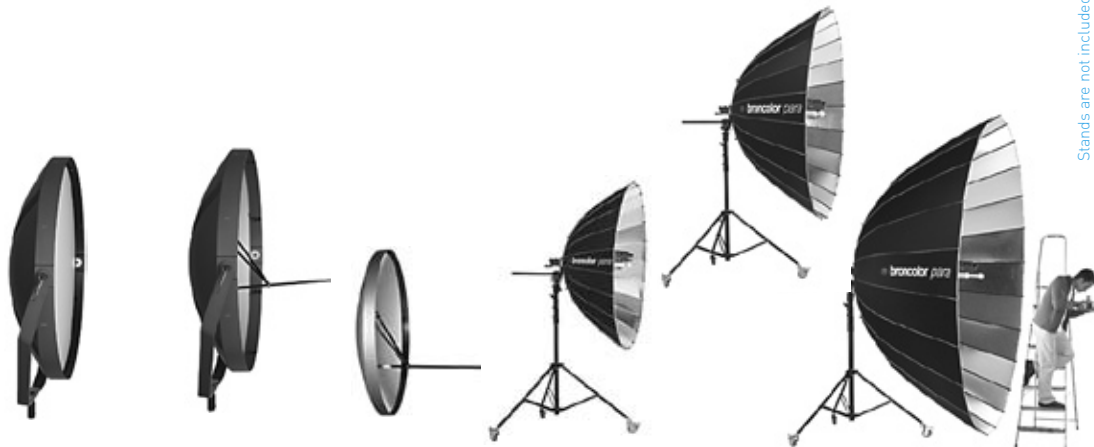
Satellite Staro 33.151.00