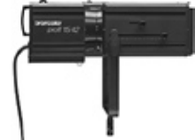
Following spot Profil 15/42 32.437.XX