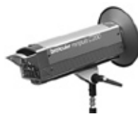
Minipuls C200 31.449.XX