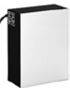
Boxlite 40 32.341.XX