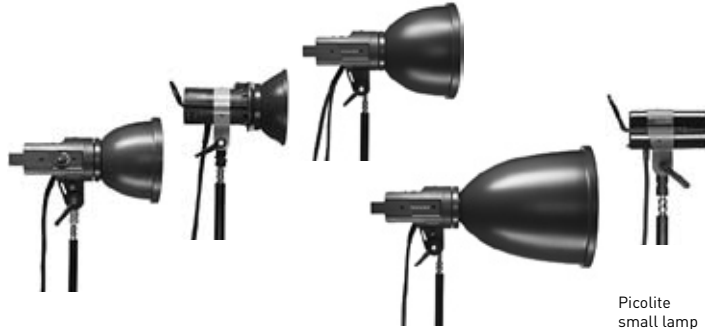
Pulso G 32.115.XX 1600 J Pulso G 32.116.XX 3200 J Unilite 32.113.XX 1600 J Unilite 32.114.XX 3200 J Pulso Twin 32.117.XX Pulso 8 32.118.XX Picolite small lamp 32.021.XX Mobilite small lamp 32.011.00