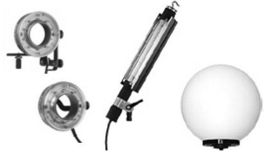
Ringflash C 32.462.XX Ringflash P 32.461.XX Litestick 32.451.00 Balloon 33.161.00