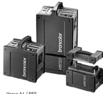
Verso A4 / RFS 31.032.XX / 31.033.XX Verso A2 / RFS 31.030.XX / 31.031.XX Power Dock for Verso A2 / A4 / RFS 36.124.00