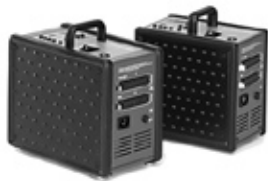
Nano 2 31.151.XX Nano A4 31.172.XX