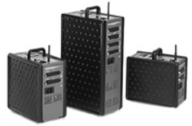
Topas A2 / RFS 31.168.XX / 31.173.XX Topas A4 / RFS 31.178.XX / 31.174.XX Topas A8 Evolution / RFS 31.184.XX / 31.183.XX