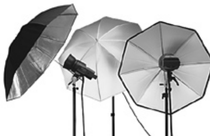
Umbrella silver Ø 82 cm 33.459.00 Umbrella silver Ø 102 cm 33.452.00 Umbrella transparent Ø 102 cm 33.454.00 Umbrella white Ø 82 cm 33.460.00 Umbrella white Ø 102 cm 33.453.00