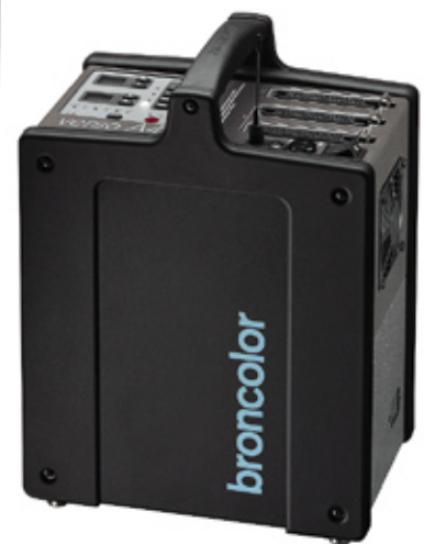
Verso A4 RFS