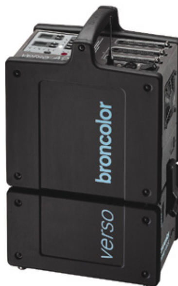
Verso A2 RFS with Power Dock

When the Verso A2 is operated on mains power, it charges to full capacity in less than a second (1.7 sec for Verso A4 at 230V). Even at maximum output, its cycle time is faster than most professional digital cameras. That also means lots of time saved for multi-shot applications! When using the Power Dock the charging time remains well below 2 seconds (1.5 sec at maximum output).