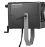
Pulso-Spot 4 32.425.XX