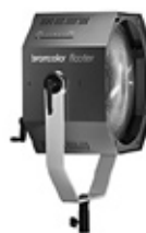
broncolor Floorer 32.431.00