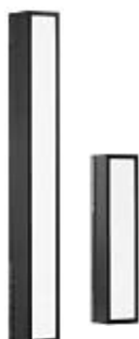
Striplite 120 Evolution 32.303.XX Striplite 60 Evolution 32.301.XX