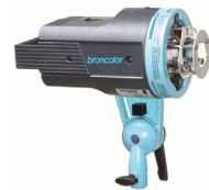
F575.800 | 42.104.XX